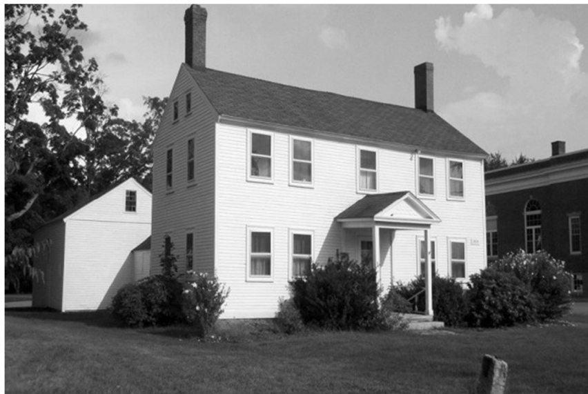
The Grace Daley House - 2017