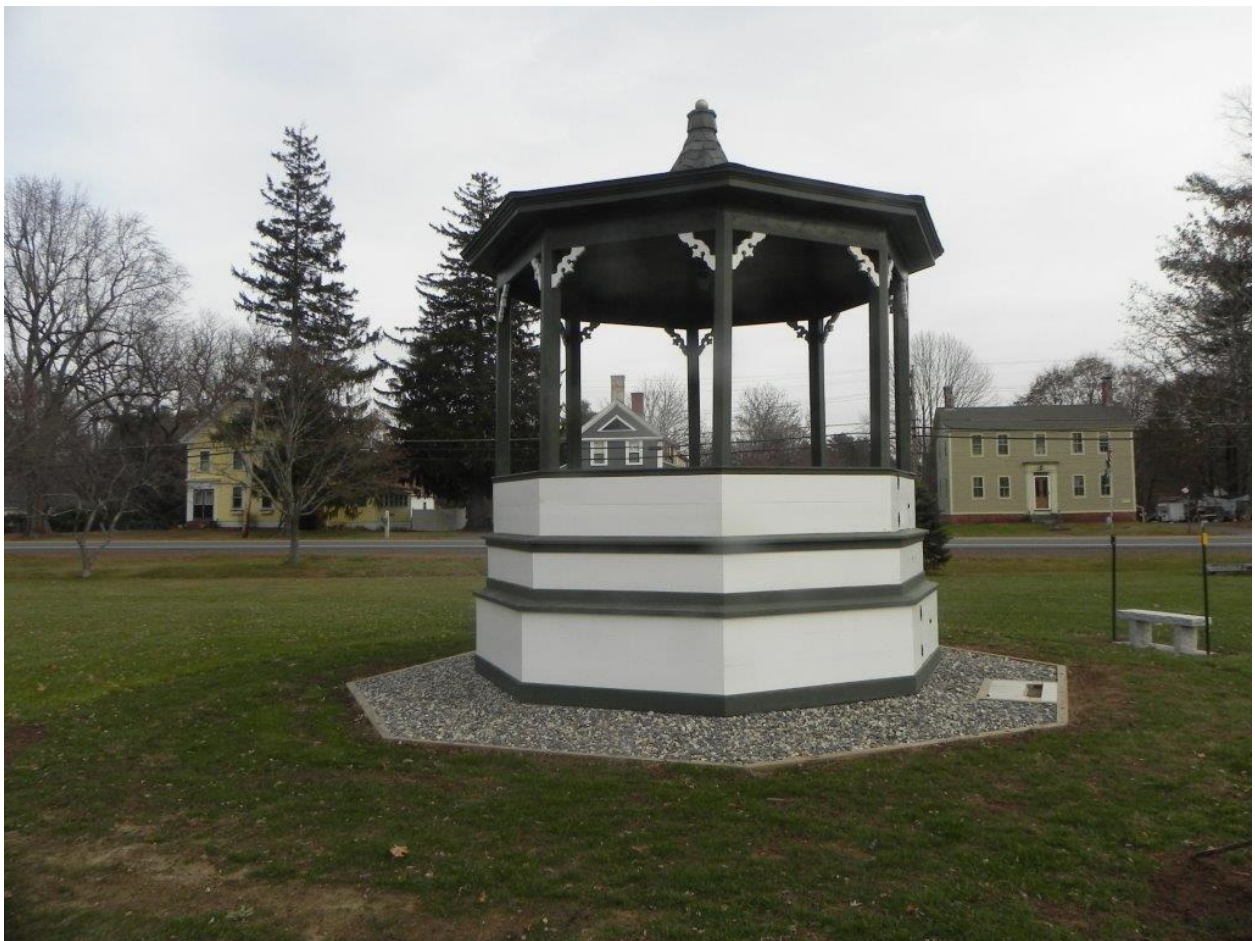
Restored Band Stand, Funded by LCHIP and Local Resources