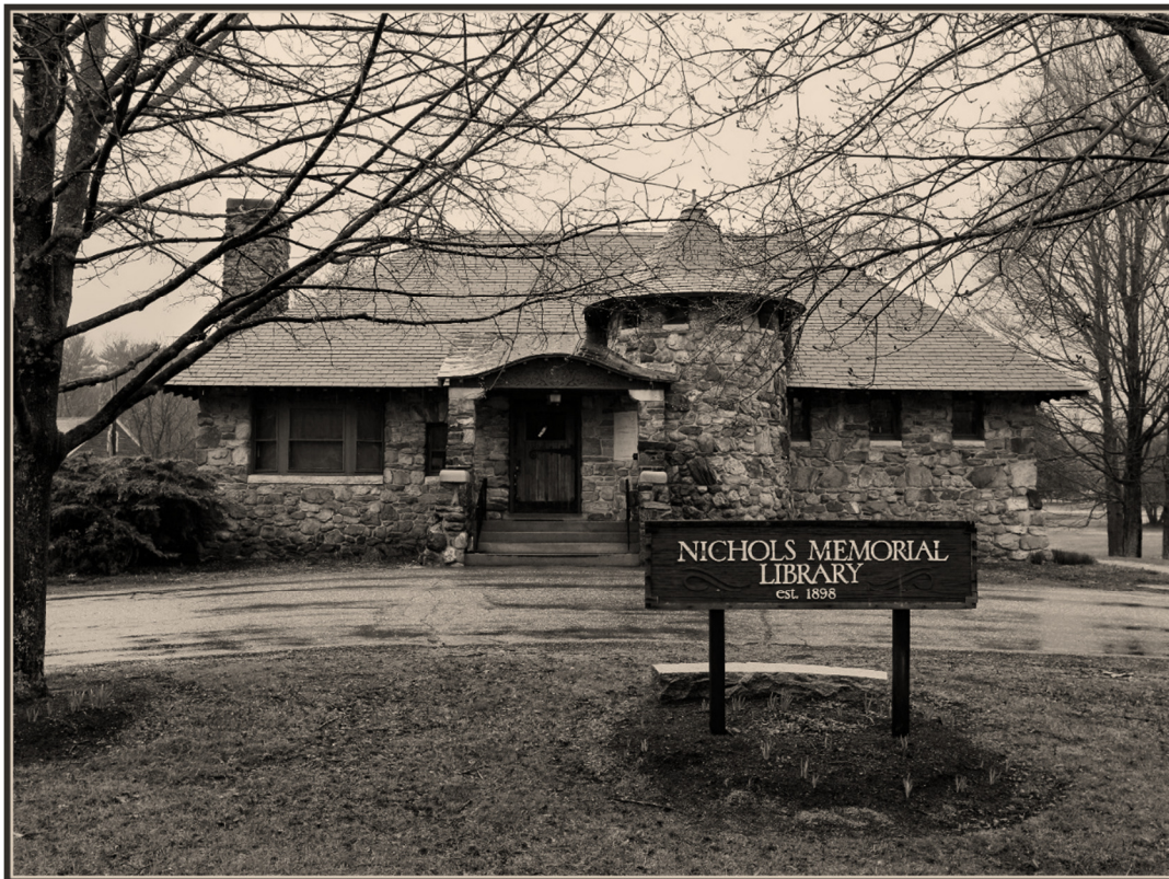
Nichols Historical Museum