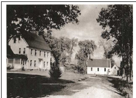
Churchill Homestead & School House