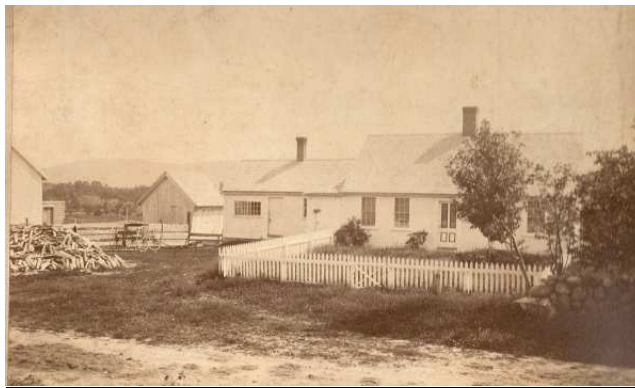
"The Garland Homestead, before 1880", it is currently known as the Prior-Belknap Farm.