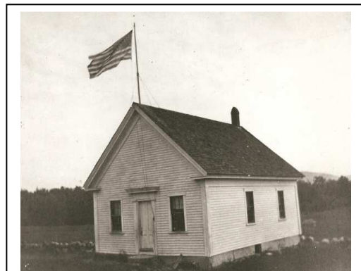
Hackett School House

As usual, we welcome any materials, whether manuscript or photo, that you would be willing to share with the archives. Many individuals have allowed us to photocopy both documents and photos from their own family or personal collections.