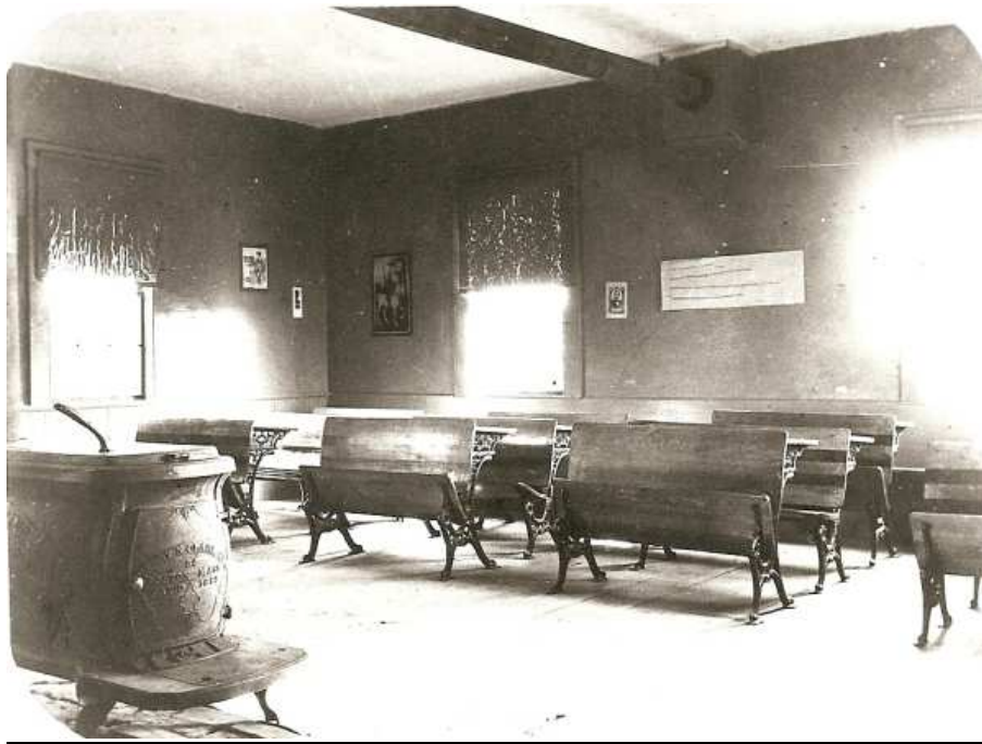
The interior of the Hackett one room schoolhouse, photographed before 1920, was typical of most one room schoolhouses.