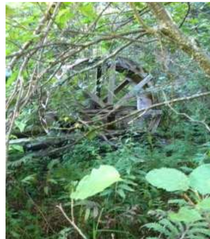
Toole's Water Wheel