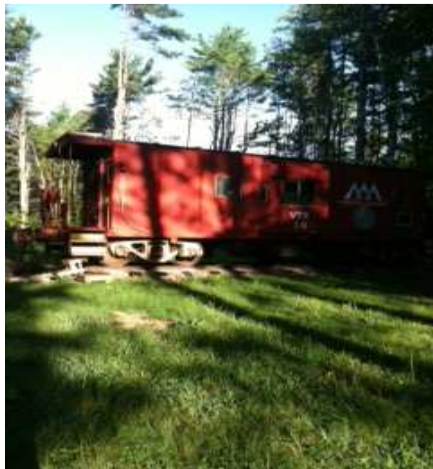
Caboose on Tumbledown Dick Road