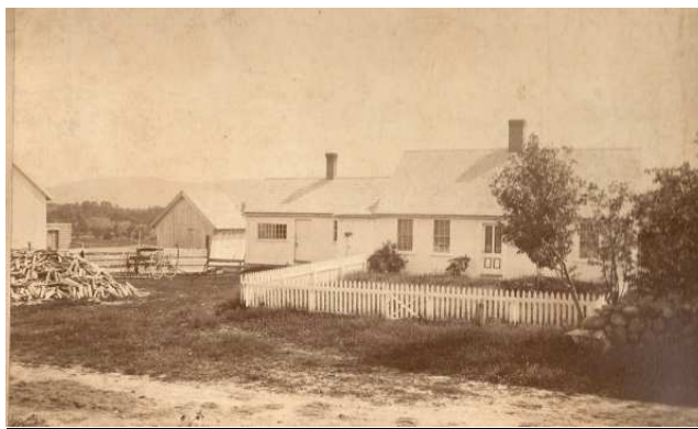
"The Garland Homestead, before 1880", it is currently known as the Prior-Belknap Farm.