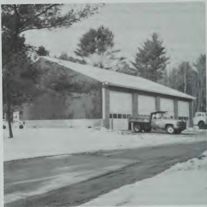
The Town of Tilton's new town garage, built in 1982