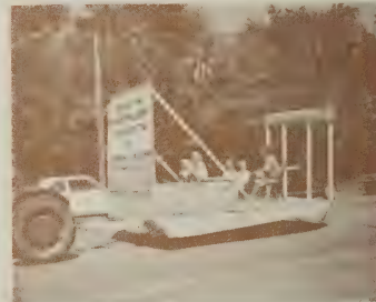
Wiggin Memorial Library's Float in the anniversary parade stressed the library's founding in 1911.