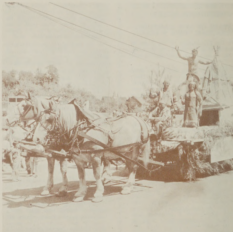
One of the prize-winners in our 250th Anniversary parade