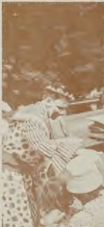
There were clowns there, too . . .