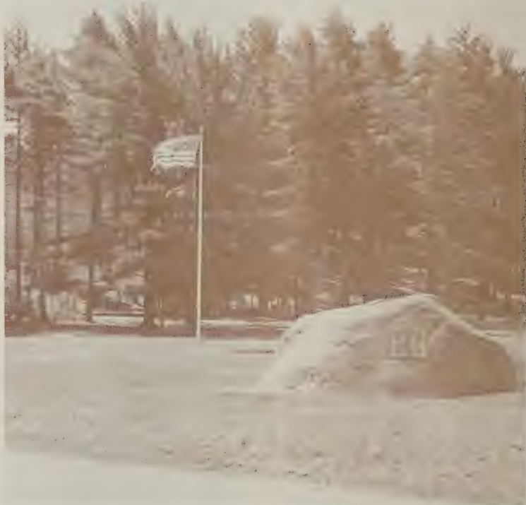
1966 was a year of improvement at Stratham Hill Park