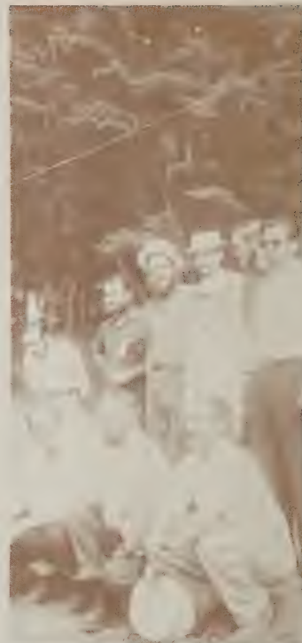
Handsome beards graced our men-folk's faces in the year of our observance