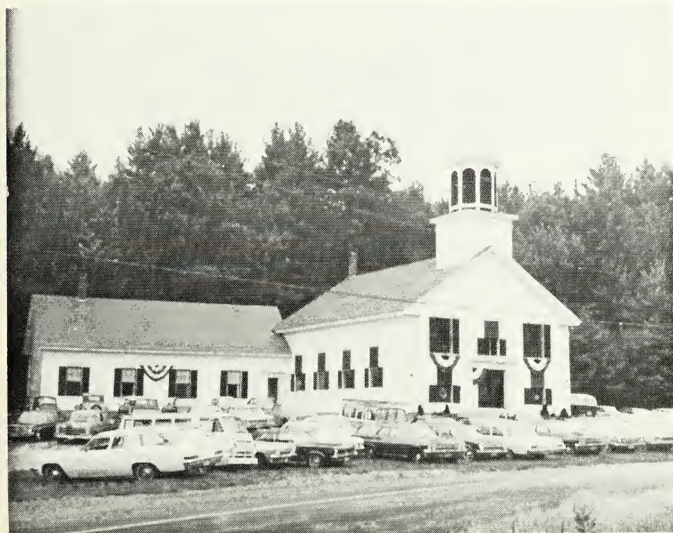
Congregational Church On Bicentennial Sunday, August 6