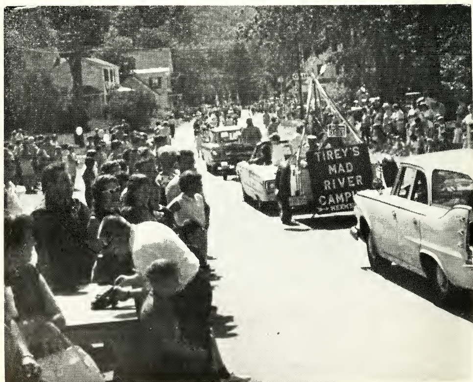
Parade Showing Throngs of Spectators