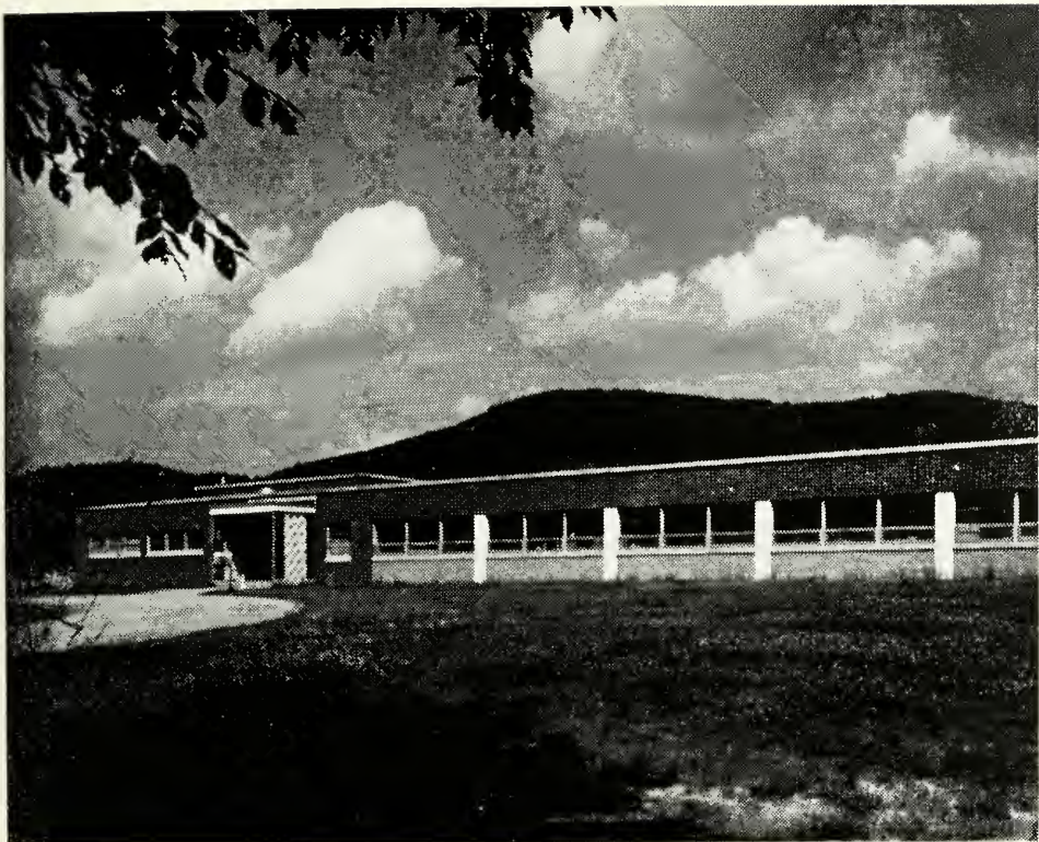
New Central School Built in 1962