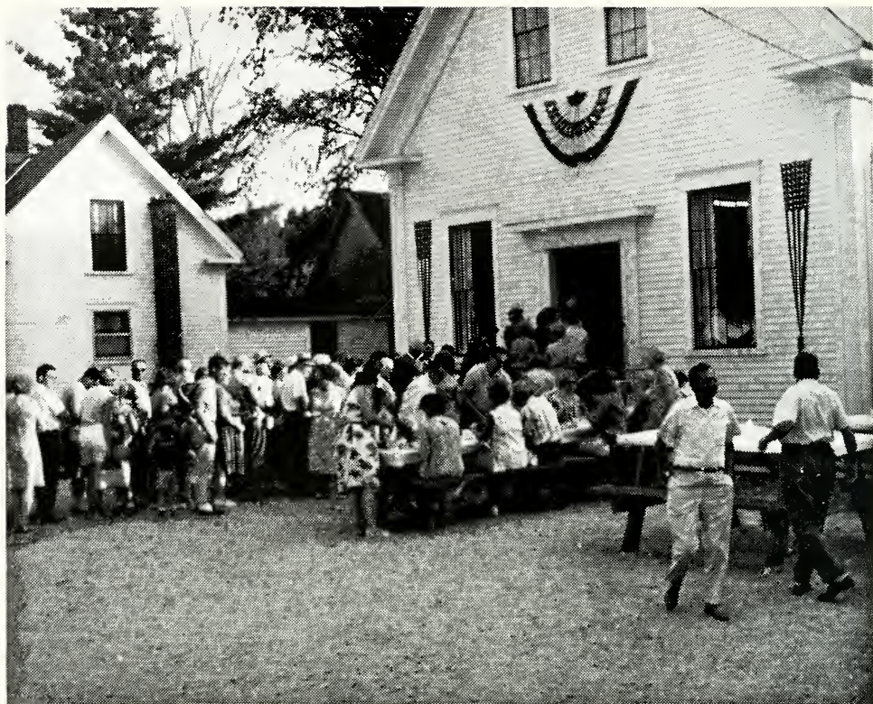
Smorgasbord at Baptist Church Vestry