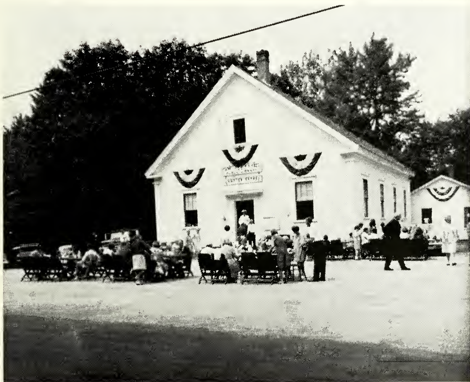
Bicentennial Barbecue at the Townhouse