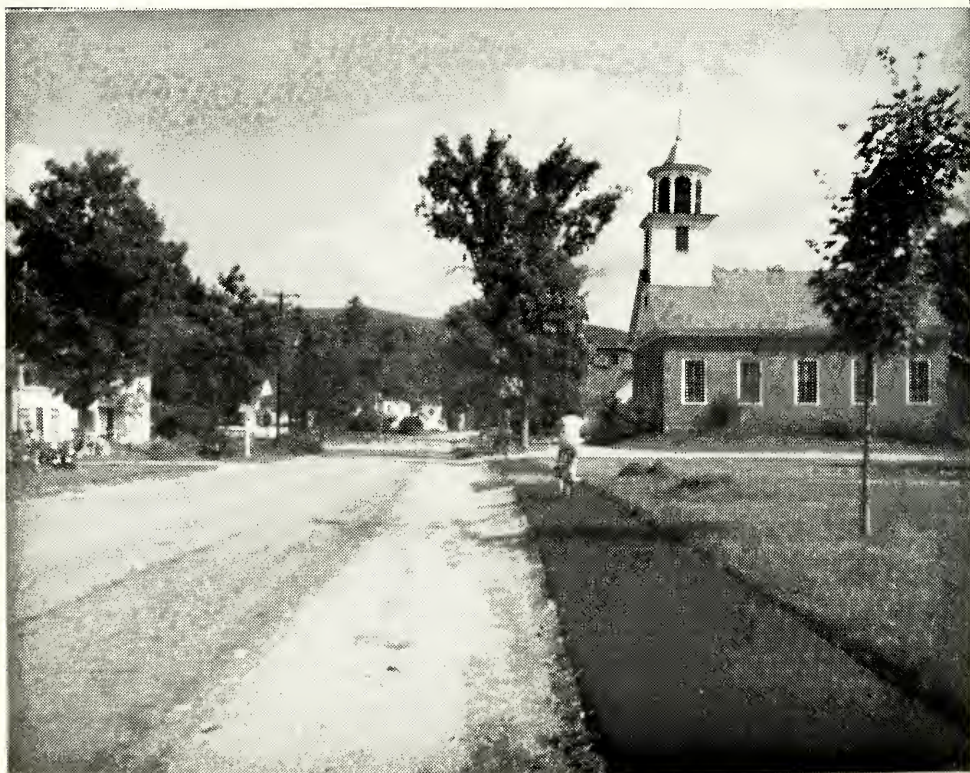
Main Street of Campton, Baptist Church in Foreground