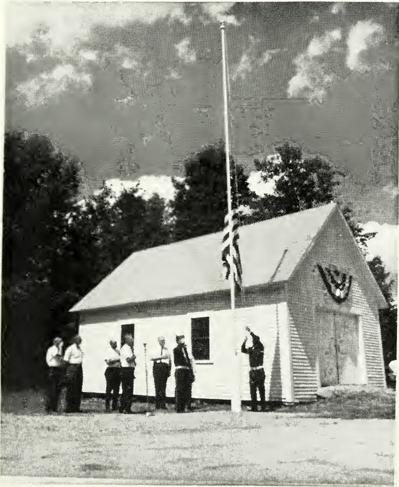
Raising of Flag Presented by U. S. Senator Norris Cotton