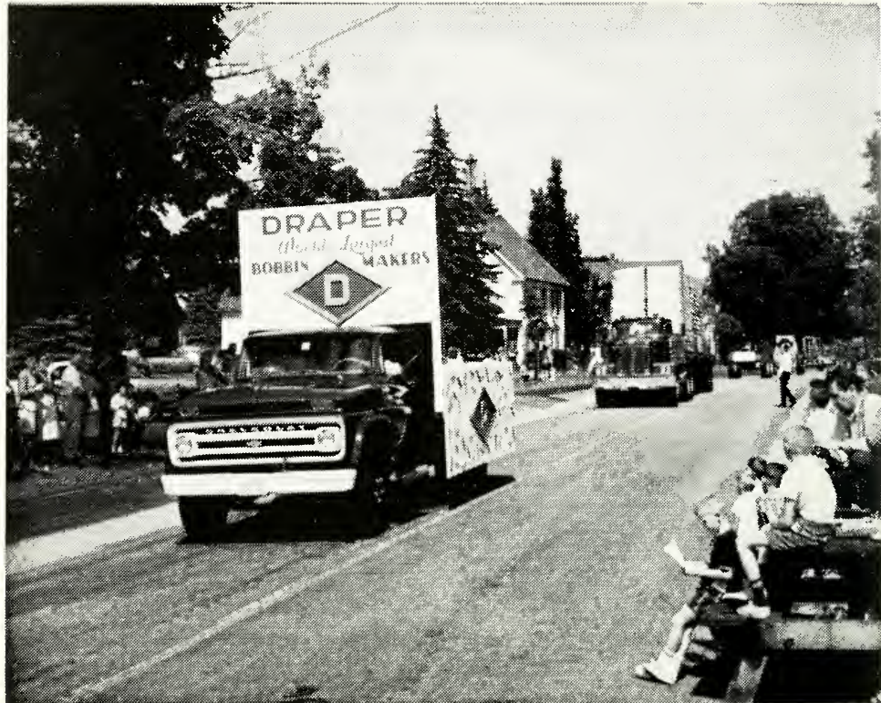
Draper Corp. Float in Parade, "World's Largest Bobbin Makers"