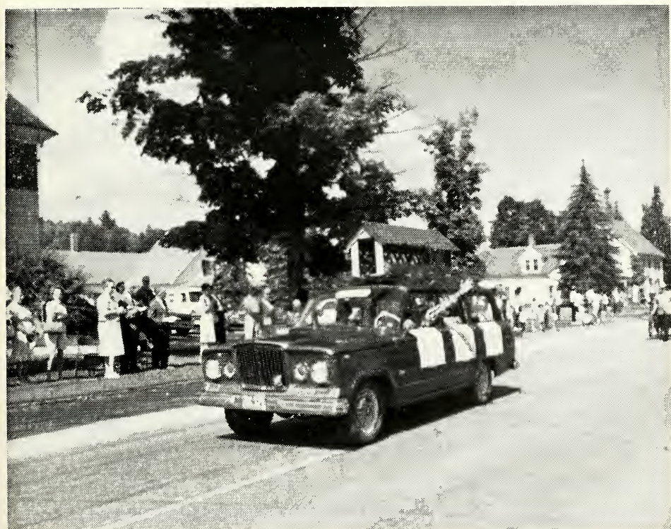
Entry Depicting Covered Bridge Theme of Bicentennial Entered by Charles O. Bierkan