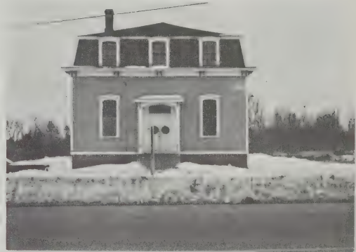
Stratham Town Hall