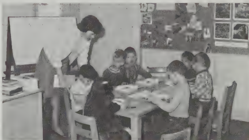
First grade reading group at work