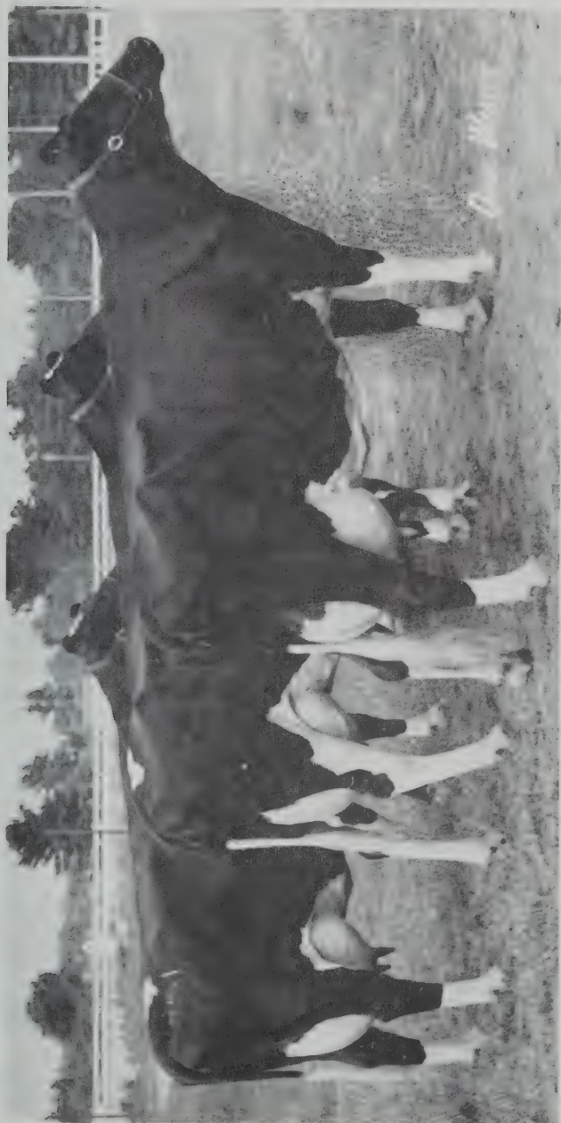
Senior Get of U.N.H. Charioteer—1970. Grafton County Farm, N.H. Grafco Charioteer Belle, Grafco Charioteer Ava, Grafco Charioteer Hazel.