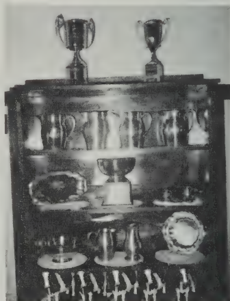
Grafton County Farm Trophy Showcase

Senior Get of Sire group and Best Three Females Group consisting of Grafco Charioteer Belle, Grafco Charioteer Ava, and Grafco Charioteer Hazel were in first place at Northern Black and White Show, and the New Hampshire Black and White Show. Two were second at Eastern States, and were chosen All-New England for the second year in succession.