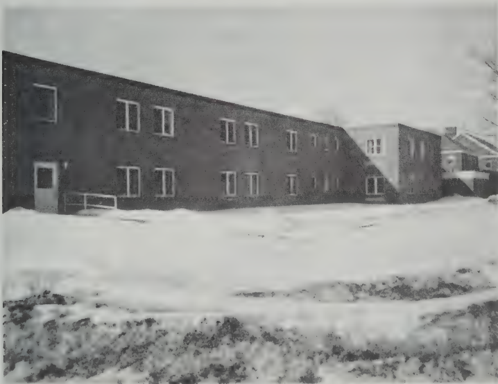
Grafton County Nursing Home Wing Addition