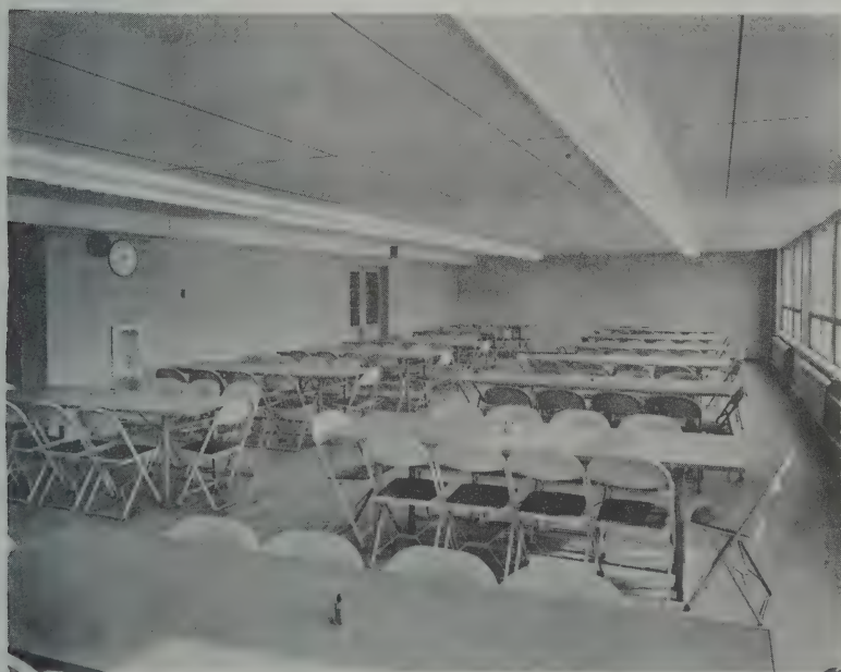
A view of the new spacious cafeteria. This new facility greatly improves the operation of the school, as it is no longer necessary to use the Home Economics kitchen for food preparation or the Auditorium for serving the Hot Lunch.