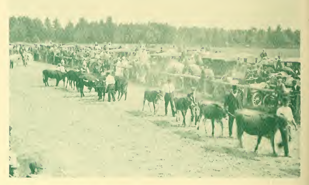
Fairgrounds Scene Around 1925

Board of Selectmen Greenfield, New Hampshire