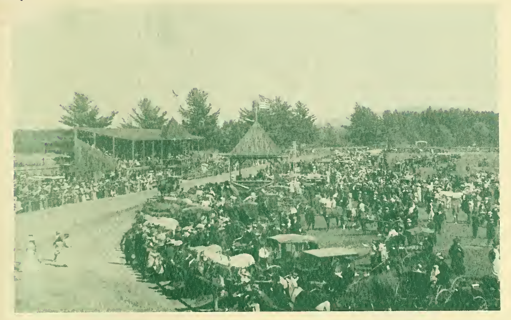
Fairgrounds Scene Around 1910