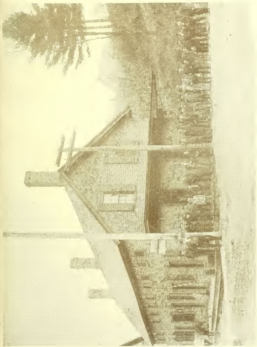
Passenger Station Enfield, N.H. Circa 1900