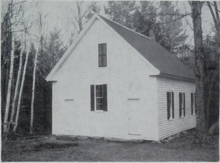
Ossipee Mountain Chapel