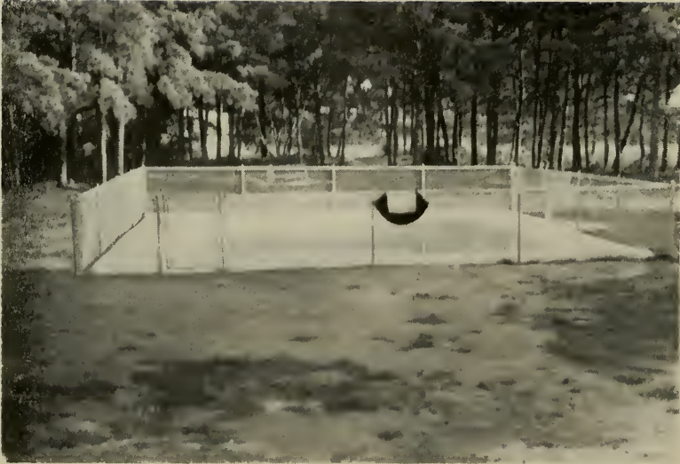
New wading pool at Memorial Park.