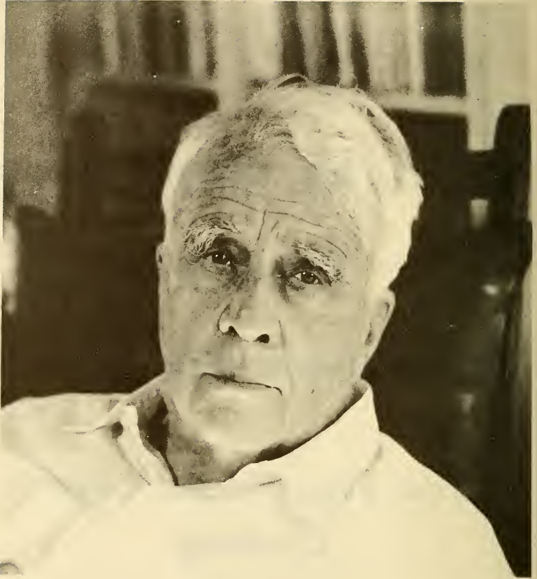
A recent portrait of the poet by Lotte Jacobi.