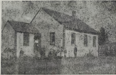
Taken 50 Years Ago

Payments to the School District represent the largest single appropriation in the Town Budget.