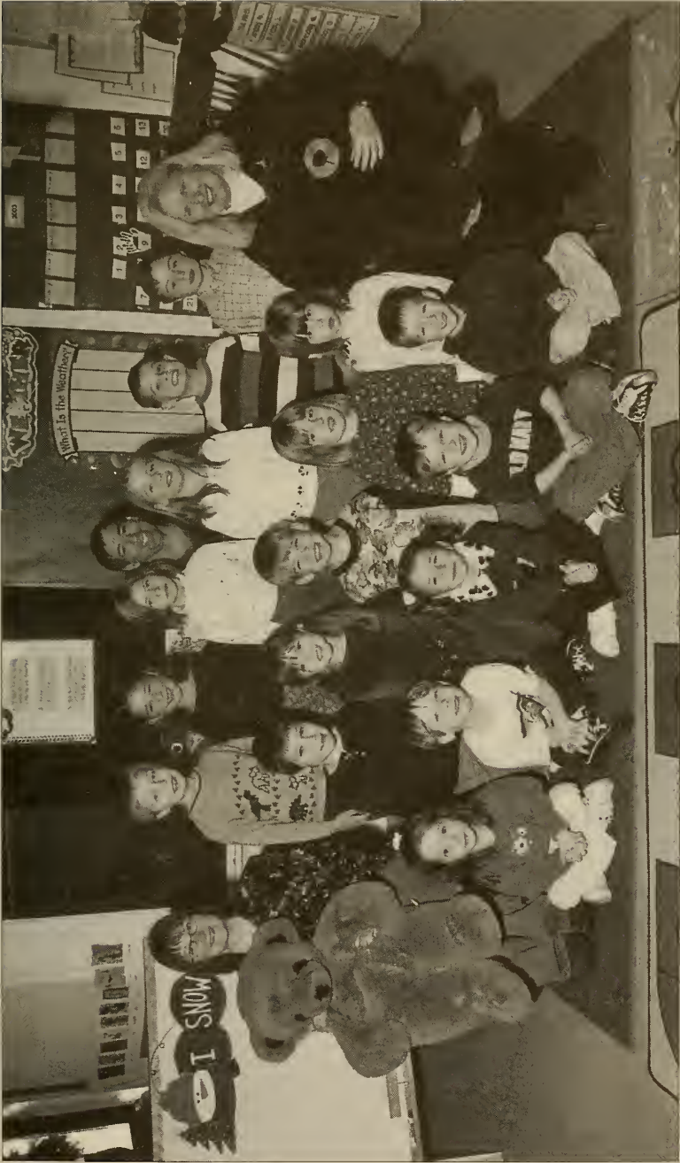
Kindergarten Class of 2004 – Springfield, N. H.