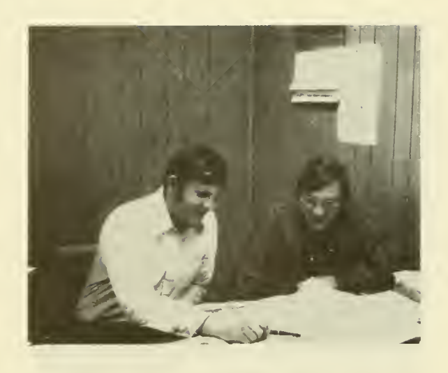
Southern Rockingham Regional Representatives