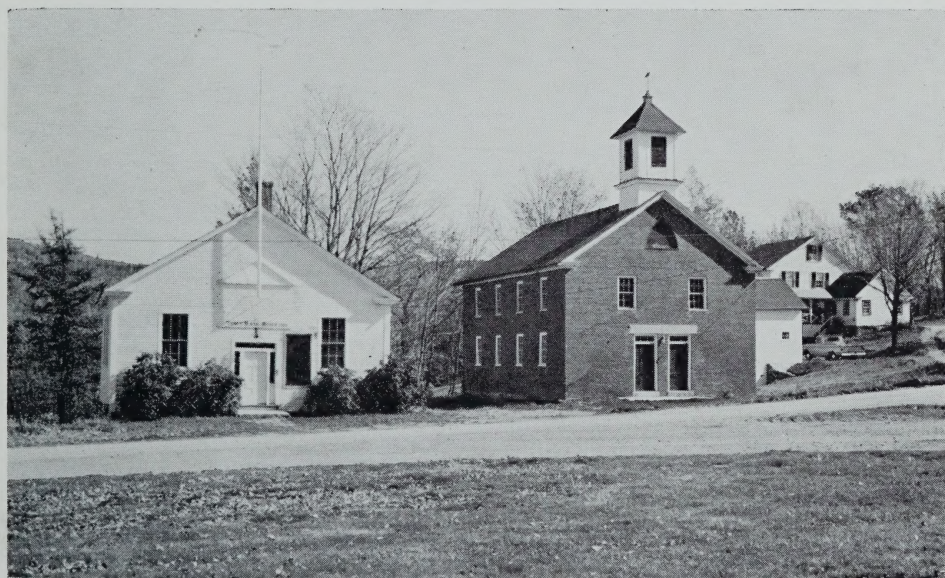
NELSON TOWN HALL 1846