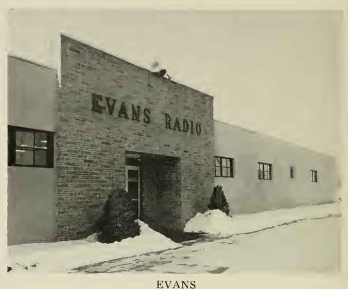
Radio, Inc. Electronics Corp. Electric Supply Co.