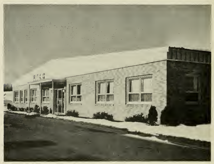
J. C. PITMAN & SONS, INC. manufacturer of Deep Fat Frying Equipment