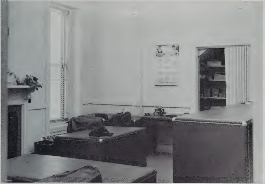
Main Office of Register of Deeds