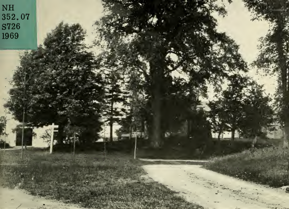
BARNARD SQUARE PRIOR TO THE FIRE OF 1912