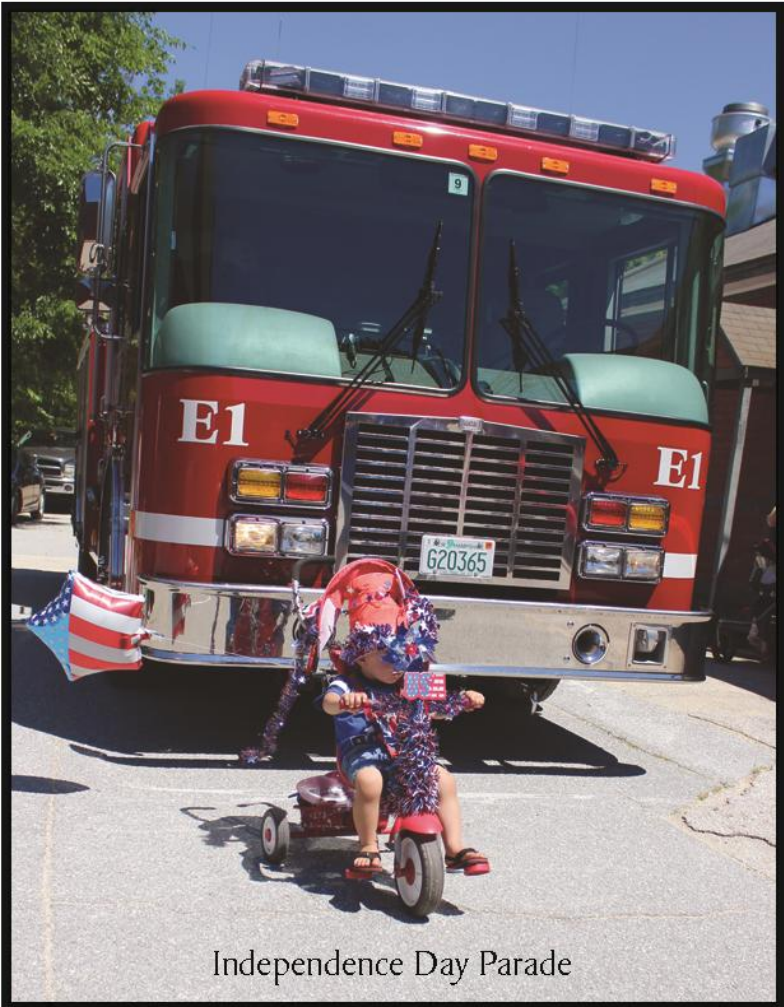
Independence Day Parade