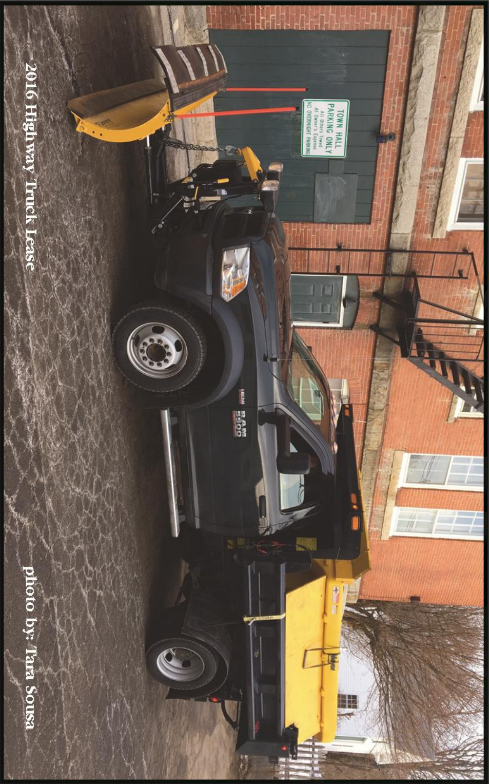
2016 Highway Truck Lease