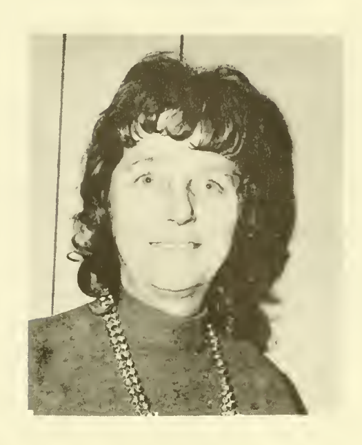
Levy of 1973