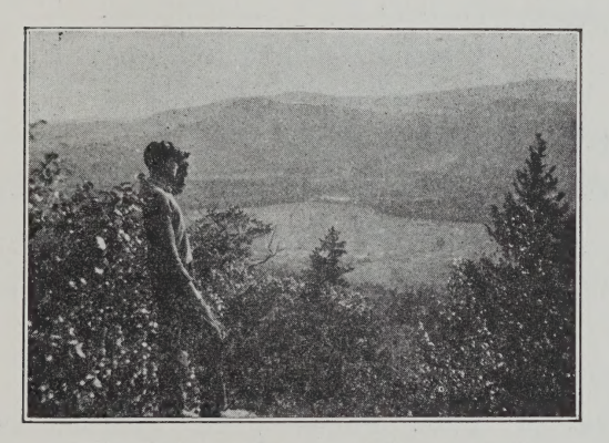
The Intervale from Gilman Hill