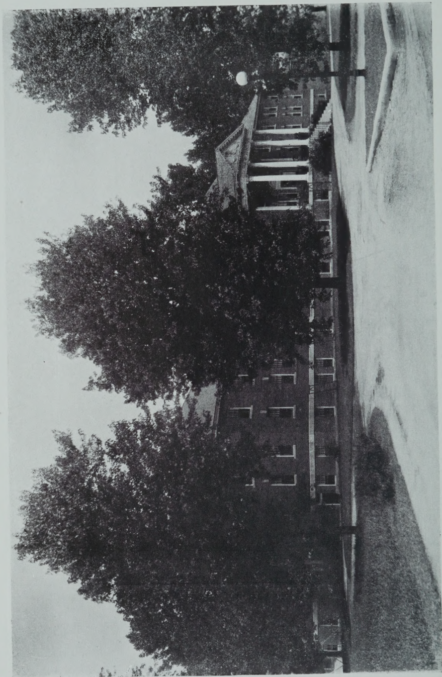
Grafton County Farm Home