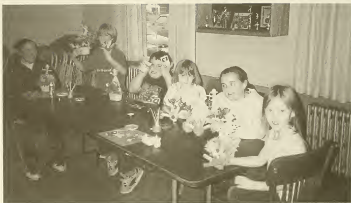
LIBRARY THANKSGIVING CRAFT DAY