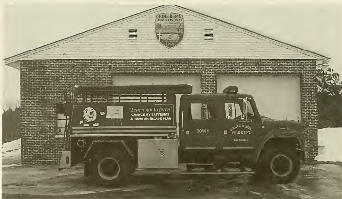
FIRE DEPT'S NEWLY COMPLETED TANK TRUCK