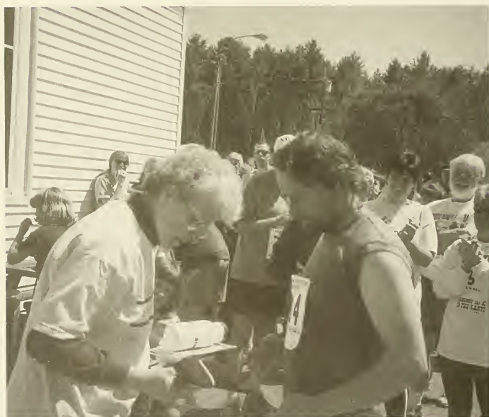
4TH ANNUAL DALTON MUD RUN