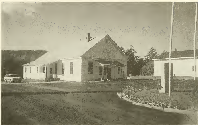
NEW PAVEMENT AT THE TOWN HALL