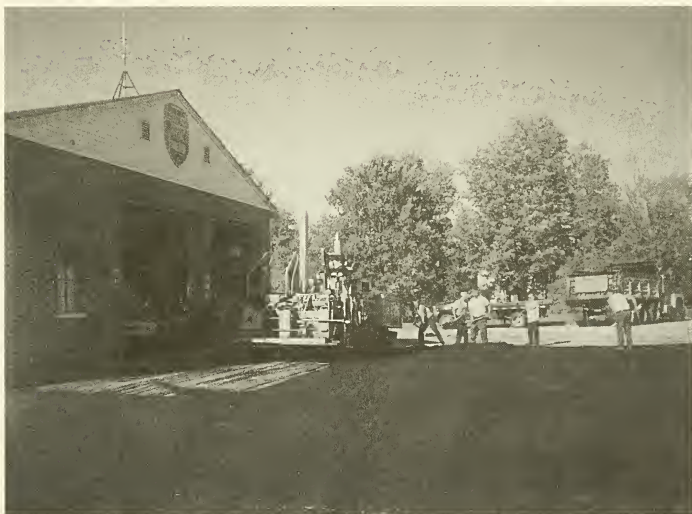
PAVERS WORKING ON THE NEW PAVEMENT