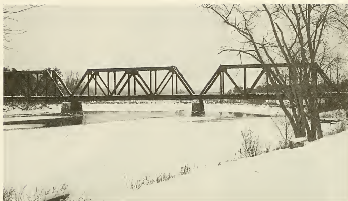
WINTER SCENE AT THE RAILROAD TRESTLE