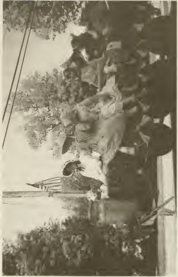
Auburn Home Academic Group in the parade, Saturday - 6/24/95.