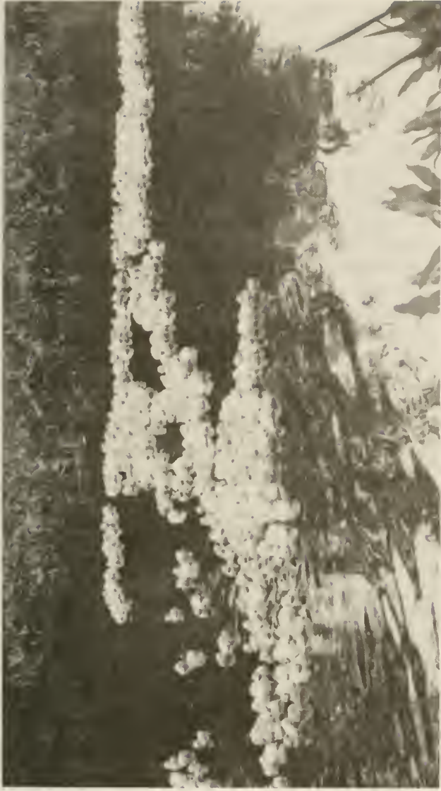
Duck Race held on Sucker Brook to raise funds for the celebration.