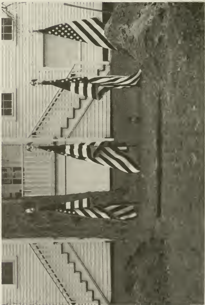
Site of the burial to the Time Capsule, November 1995.