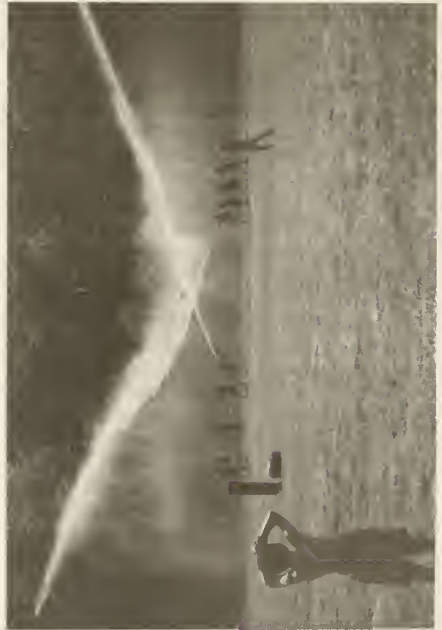
Firemen's Muster at Prestons Field, Saturday - 6/24/95.