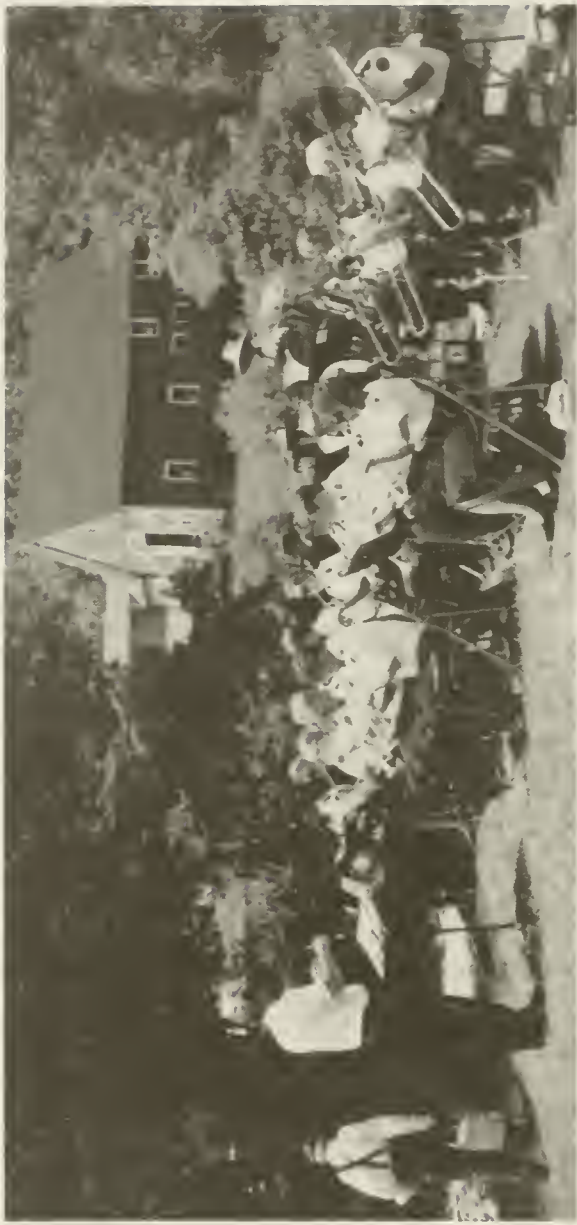
Nevers Band at Griffin Mill Site, Saturday - 6/24/95.