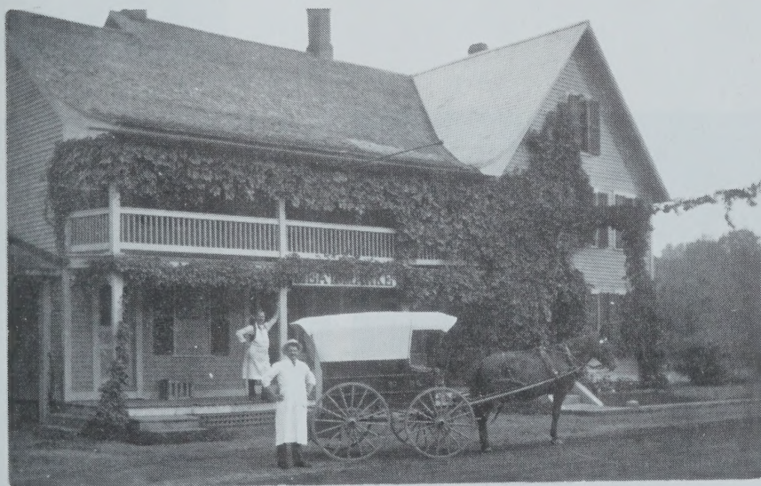
ABBOTT'S MEAT MARKET