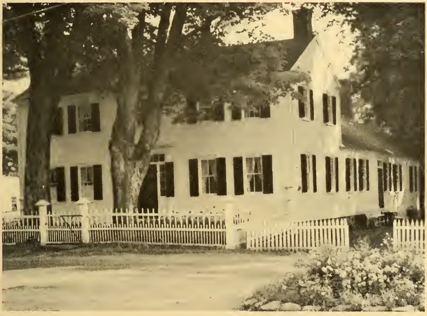
Jonathan Wright Homestead