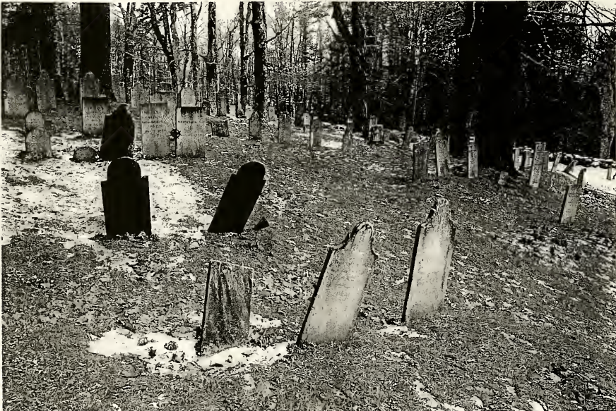
The Roxbury Cemetery.....illustrating the need for Repair and Restoration work.