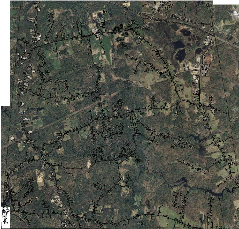
Figure 3: Impervious and pervious land cover statistics for the town of Brentwood