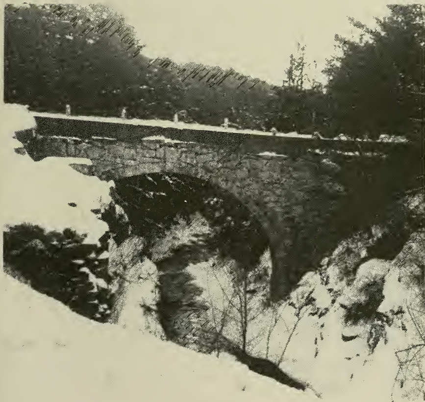
Historic Gilsum Stone Arch Bridge