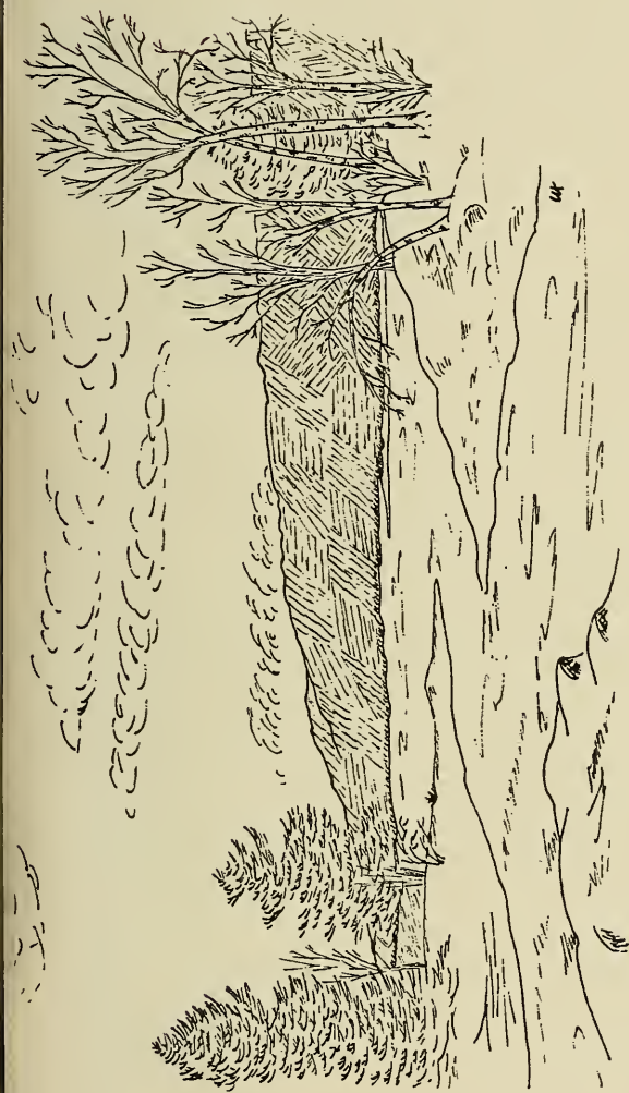
Deering Lake from The Dam