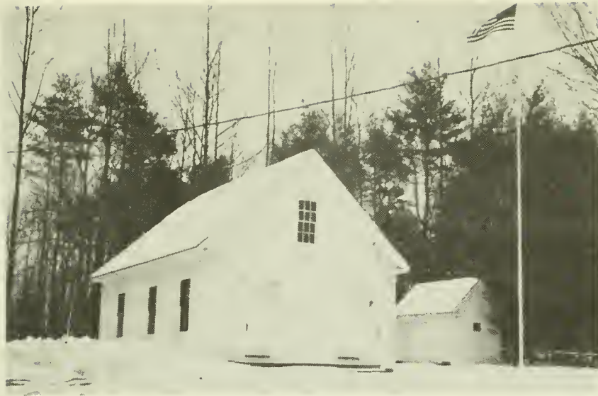
Beach Plain School (Presently V.I.S. building)