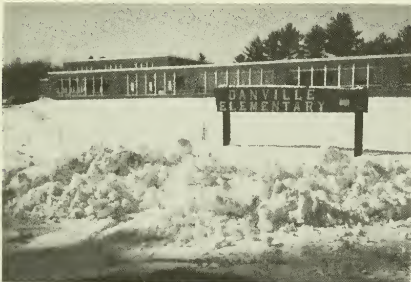
Danville Elementary School