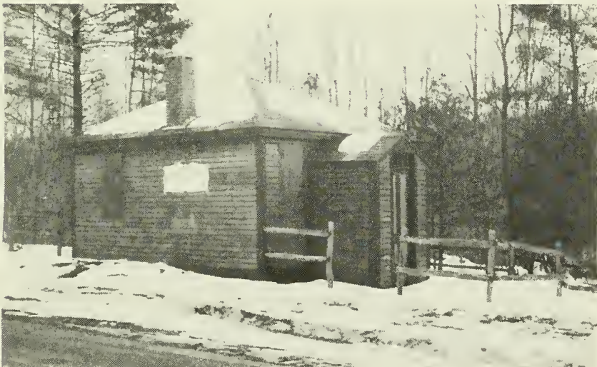
Little Red Schoolhouse