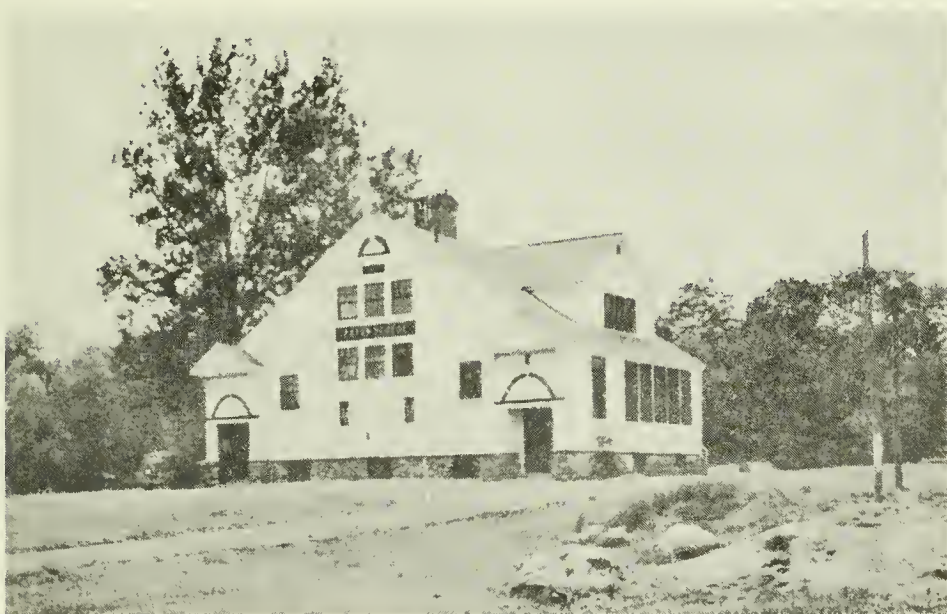
(the former) Eaton School