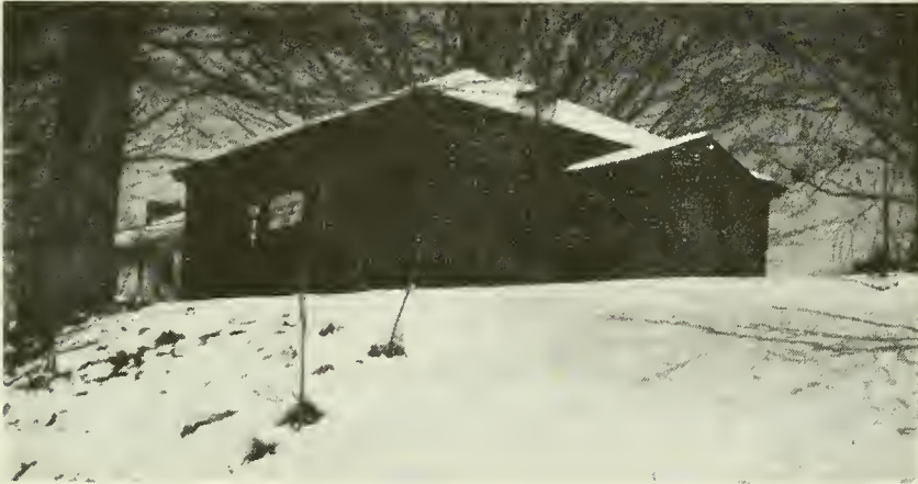
Old Red Schoolhouse