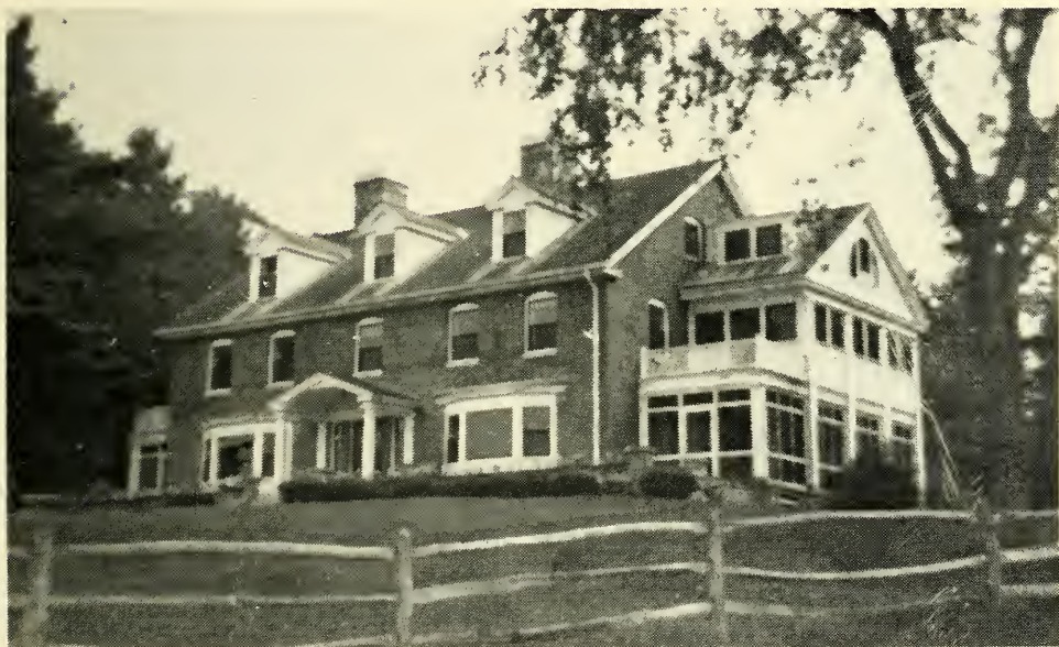
Founders Hall, Belknap College — Center Harbor, New Hampshire