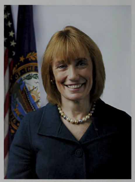
Governor MARGARET WOOD HASSAN