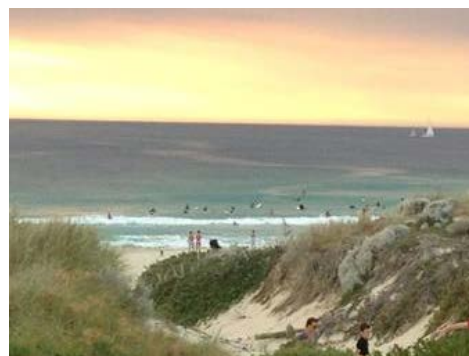
An evening at Trigg Beach in Perth, Australia

My daughters (ages 6 and 9) and I traveled to Perth, Australia in late January and we immediately became immersed in the "Aussie lifestyle" by residing with the Fairchild family (Tim, his wife and two children ages 4 and 6). Typical days included early morning runs along the coast, work at Murdoch University (referred to as "Uni" by all the professors), and late afternoon trips to the beach with the kids. Weekends were filled with family activities of hikes in the bush, kangaroo watching and of course, surfing and boogie boarding at the beach. What stood out to me most about this Aussie lifestyle were the laid back attitudes often accompanied by the saying "No worries, mate". This was very important for me to observe at Uni as I was surrounded by prestigious and productive scholars that had a high quality of life and appeared to have no worries. As I reflect back on my time at Uni, I want to continue that important balance between family and work.