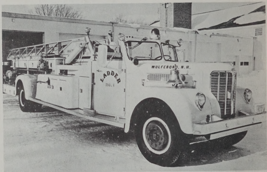
Aerial Ladder Truck, 1978