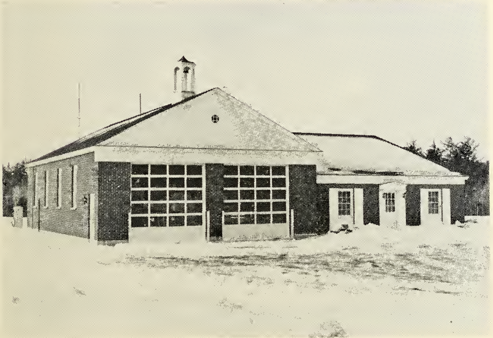
OUR NEW FIRE STATION