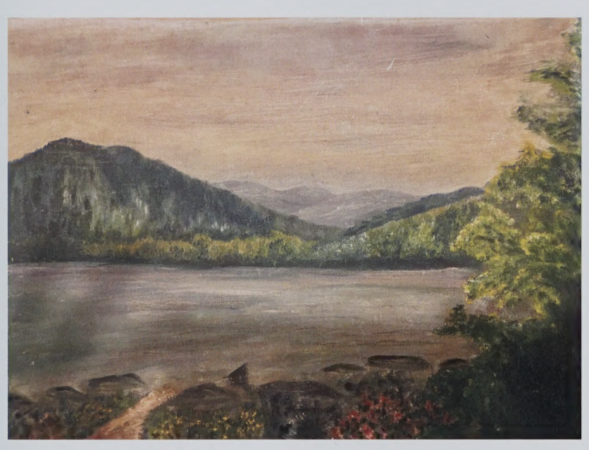
Painting of Ellsworth Pond, 1950