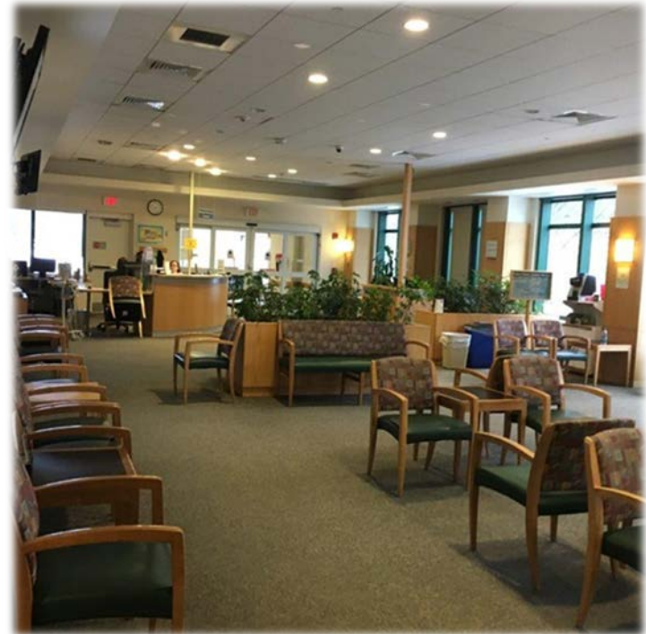
Current Waiting Room and Reception Desk