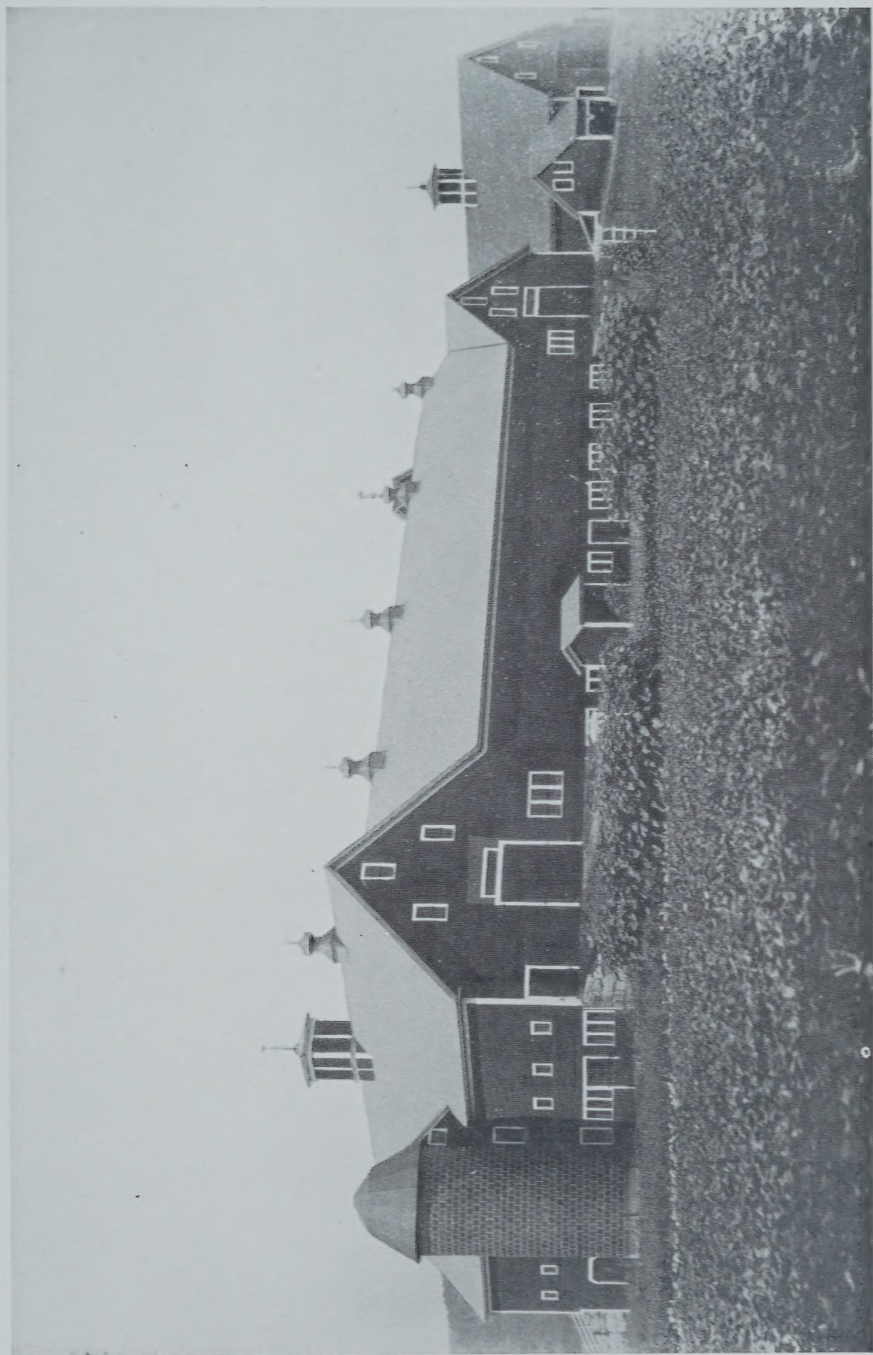
GRAFTON COUNTY FARM BARN