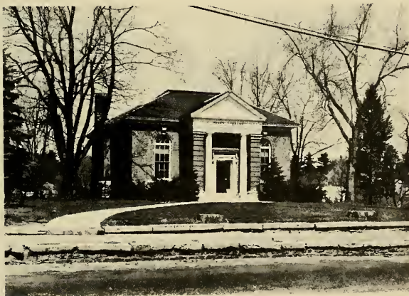
Derry Public Library