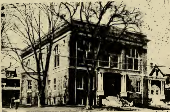
Adams Memorial Building