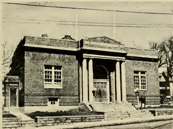
Veterans Memorial Building