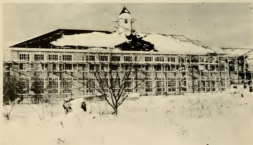
The Derry Elementary School is about 65% complete at the time of this picture. It will house six grades, and will be ready along with the Hood Memorial School for classes in September.