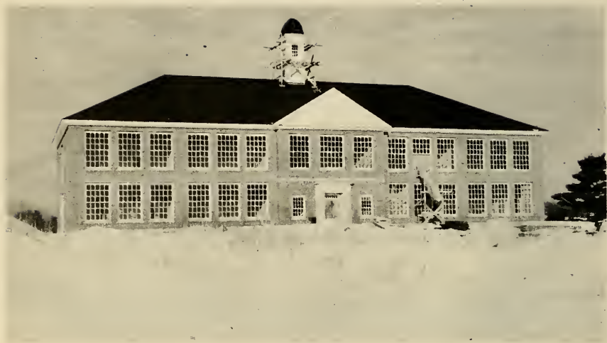
The new Hood Memorial School will house the 7th, 8th, and 9th grades. At the time of this picture the school is about 80% complete. It will be finished in June, ready for classes in September.