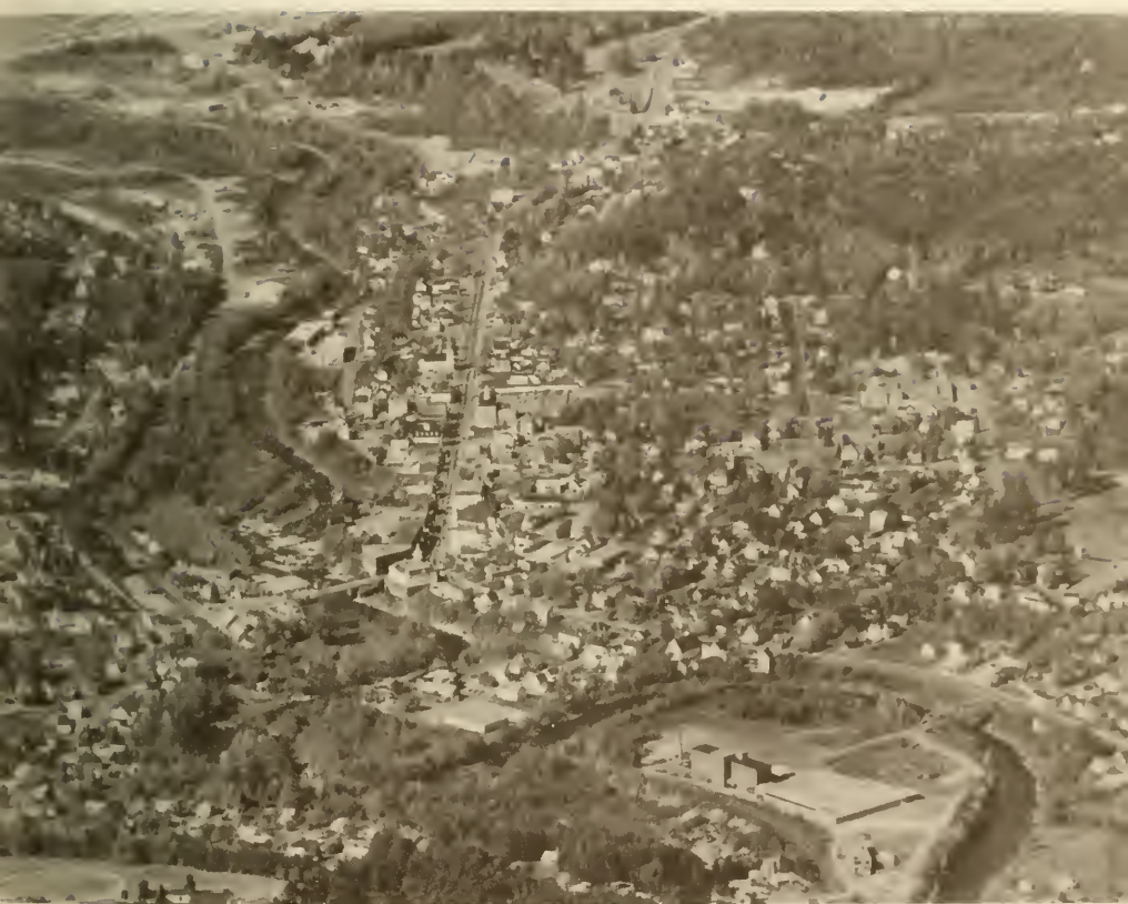
Littleton, Looking West