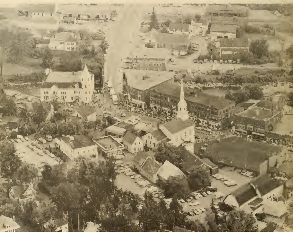
Looking East at the Intersection of Rte. 116 & 302