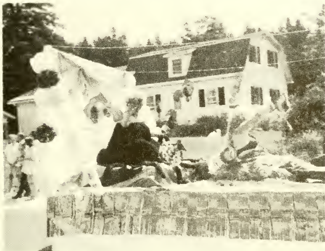
Firemen's Auxiliary Float