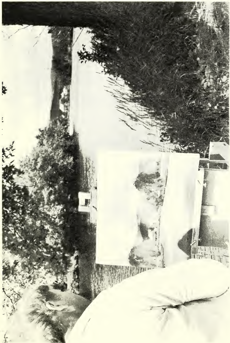
Dalton's share of the beautiful Connecticut River