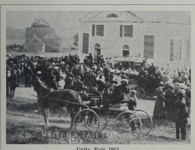
Unity Fair 1912