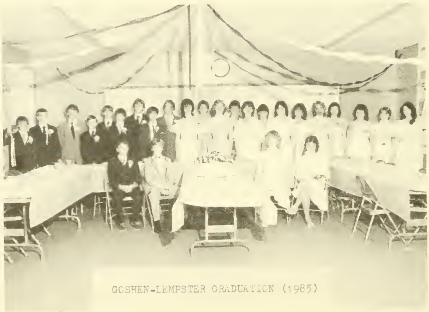
GOSHEN-LEMPSTER GRADUATION (1985)