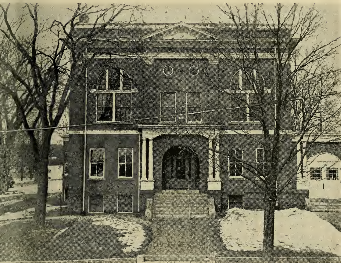
ADAMS MEMORIAL BUILDING