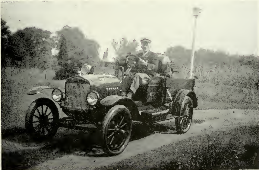
BOSCAWEN'S FIRST MOTORIZED FIRE UNIT