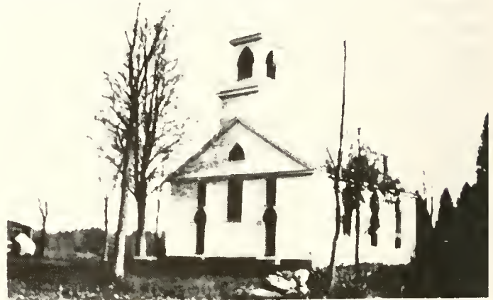
M.E. Church - Auburn - Fall 1922