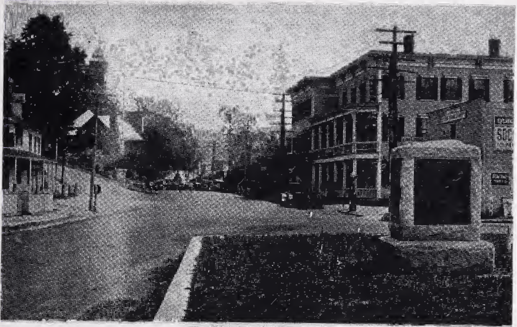
Wars' Memorial, Wilton, N. H.